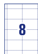
4 60 x 90 L4728-20