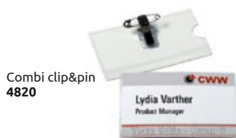
Combi clip&pin 4820