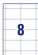
9 60 x 90 L4728-20