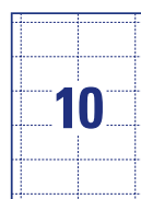
6 54 x 90 4820